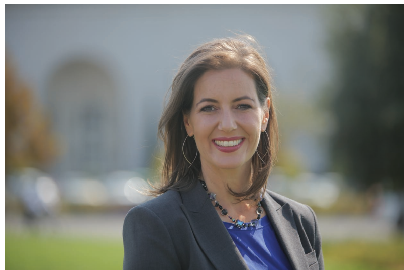
Libby Schaaf, Mayor Elect